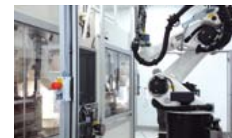
Robot for stripping