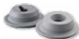
The part: pharmastopper

Automation has the advantage that any risk of human contamination is eliminated on all stations (compound preparing, part stripping and transfer to the cutting tool).