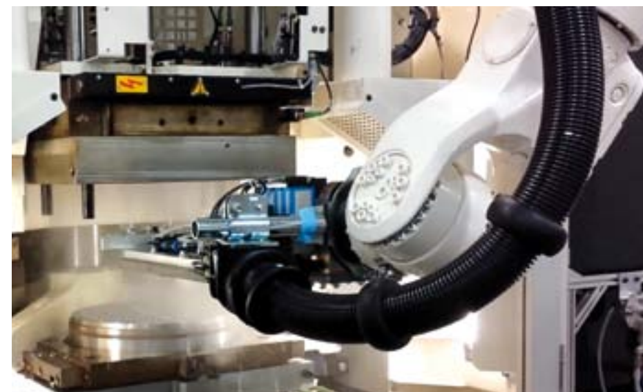
View of the robot during the stripping phase

Thanks to the injection-compression molding on the 2 CMS machines, the customer can now produce 41,880 parts/hour with a