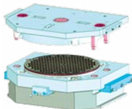
3D-view of the injection-compression mold, 413 cavities

Please note that the unit is operated in a controlled atmosphere where production constraints are particularly stringent.